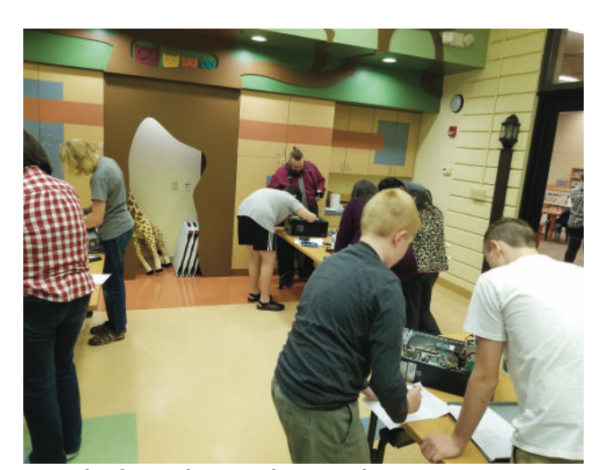
Everybody works together to take-apart a computer.