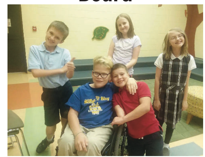
Some of the Kids Advisory Board members.