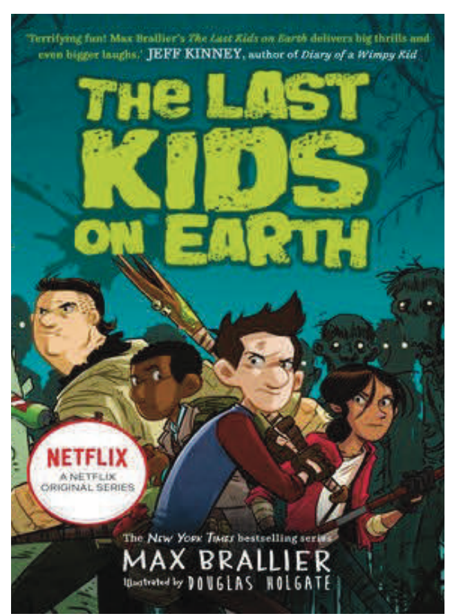
Publisher: Viking Books for Young Readers, 2015