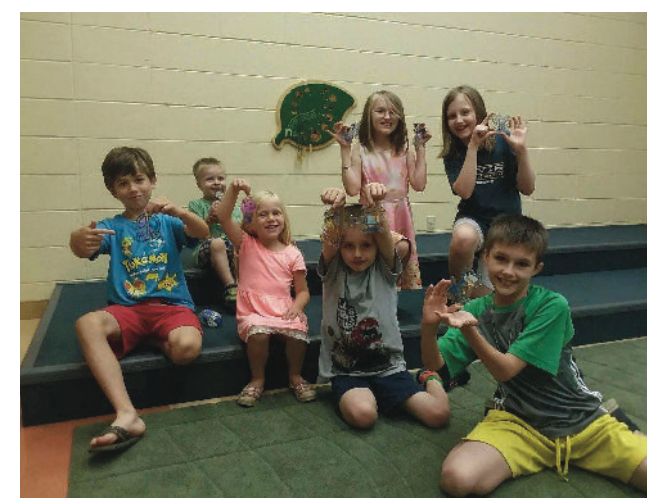
The kids show off the suncatchers they made!

Everyone sat with their families and ate ice cream. We had our pictures taken and then we just enjoyed the rest of the party. It was a great way to start the back-to-school season!