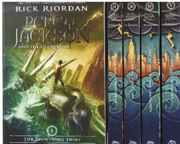
Publisher: Miramax Books, 2005

about his godly heritage. The main characters are Percy Jackson, who is trying to wrap his head around the idea that Greek myths are real and find out who his dad is, Grover Underwood who is Percy's best friend, and