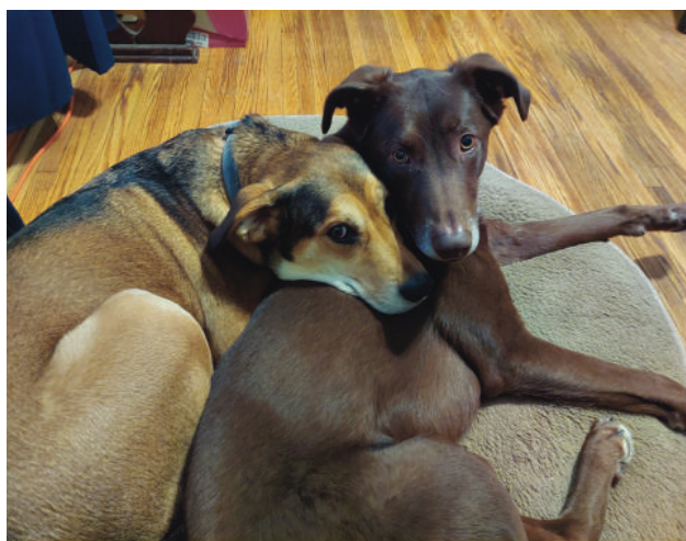
Henry & George attended the event.

Once you know what type of pet you want, you can go to petharbor.com to look at the animals available. You will want to select Peoria County Animal Control and Protection Services. The process for adopting animals is different now because of COVID-19. You will have to fill out an application before visiting the shelter. After your application is approved, then you can schedule a time to visit and meet the animals. With a dog you can go outside and play, and with a cat there is a special room where you can make sure they are the right pet for you. There are some small animals so you will watch them in their cage.