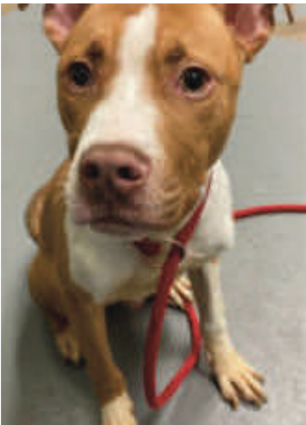
York, a Pit Bull Terrier, made a guest appearance.